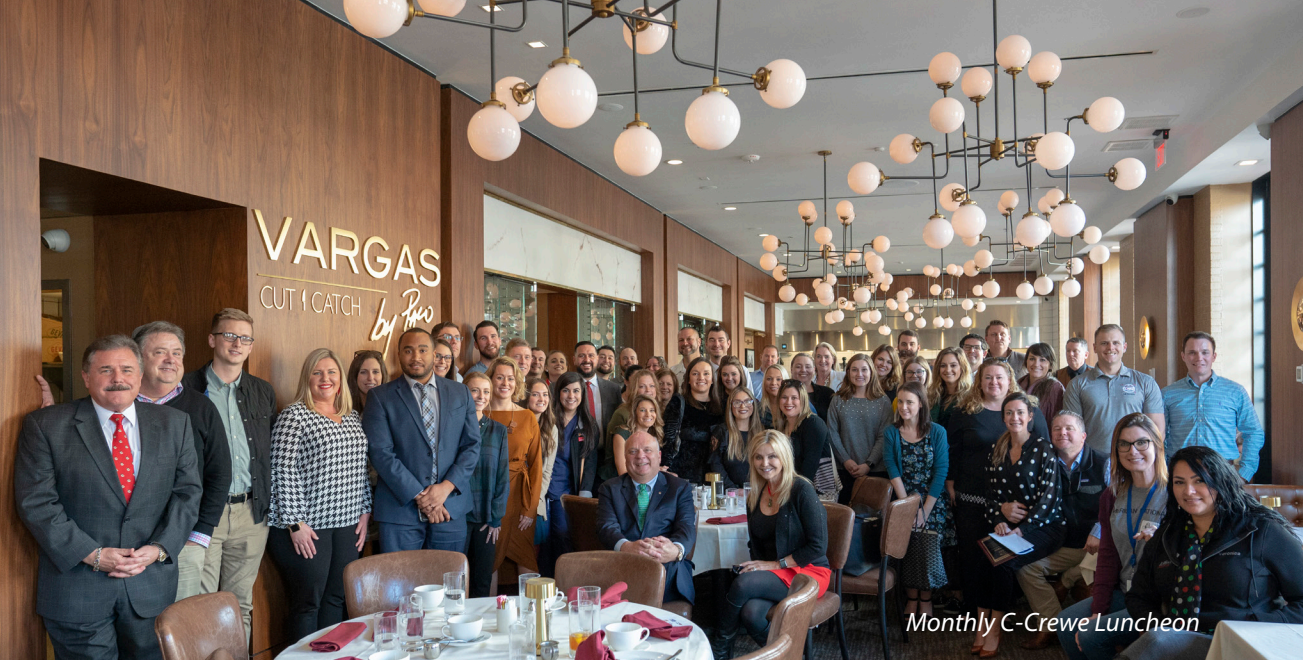
Monthly C-Crewe Luncheon