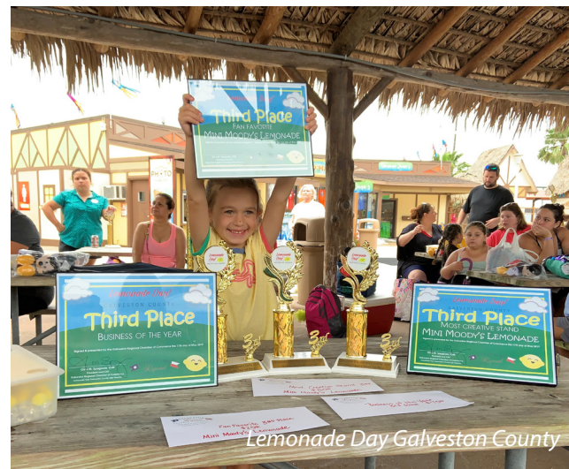
Lemonade Day Galveston County