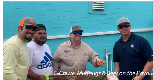
C-Crewe Mudbugs & Beer on the Bayou