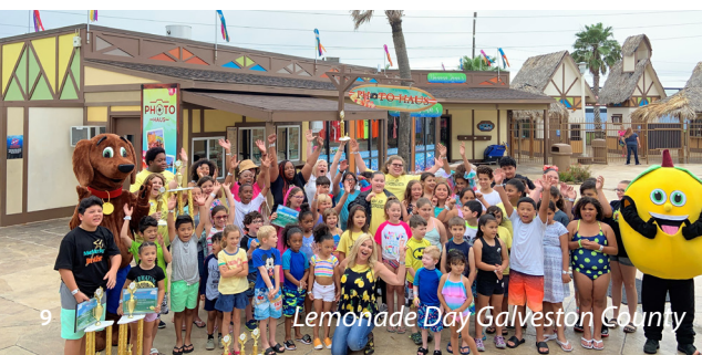
Lemonade Day Galveston County