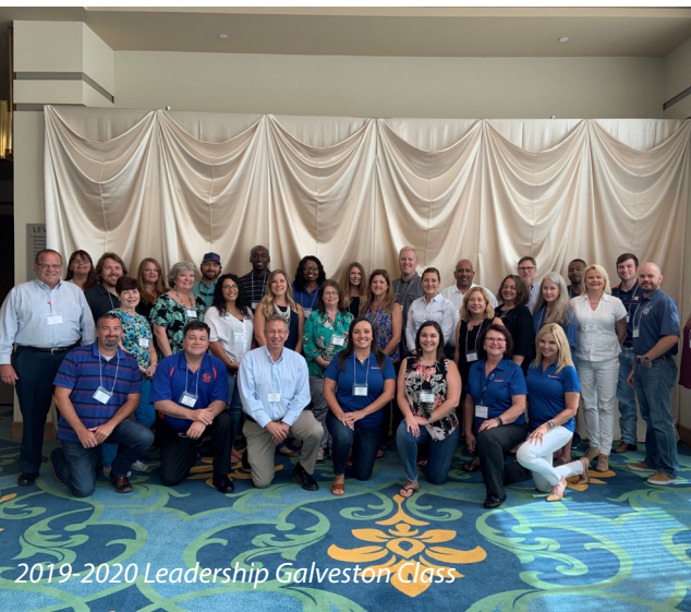
2019-2020 Leadership Galveston Class